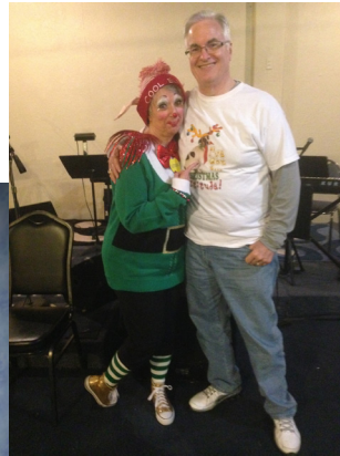
Patsy and husband getting ready to serve the homeless with their church.