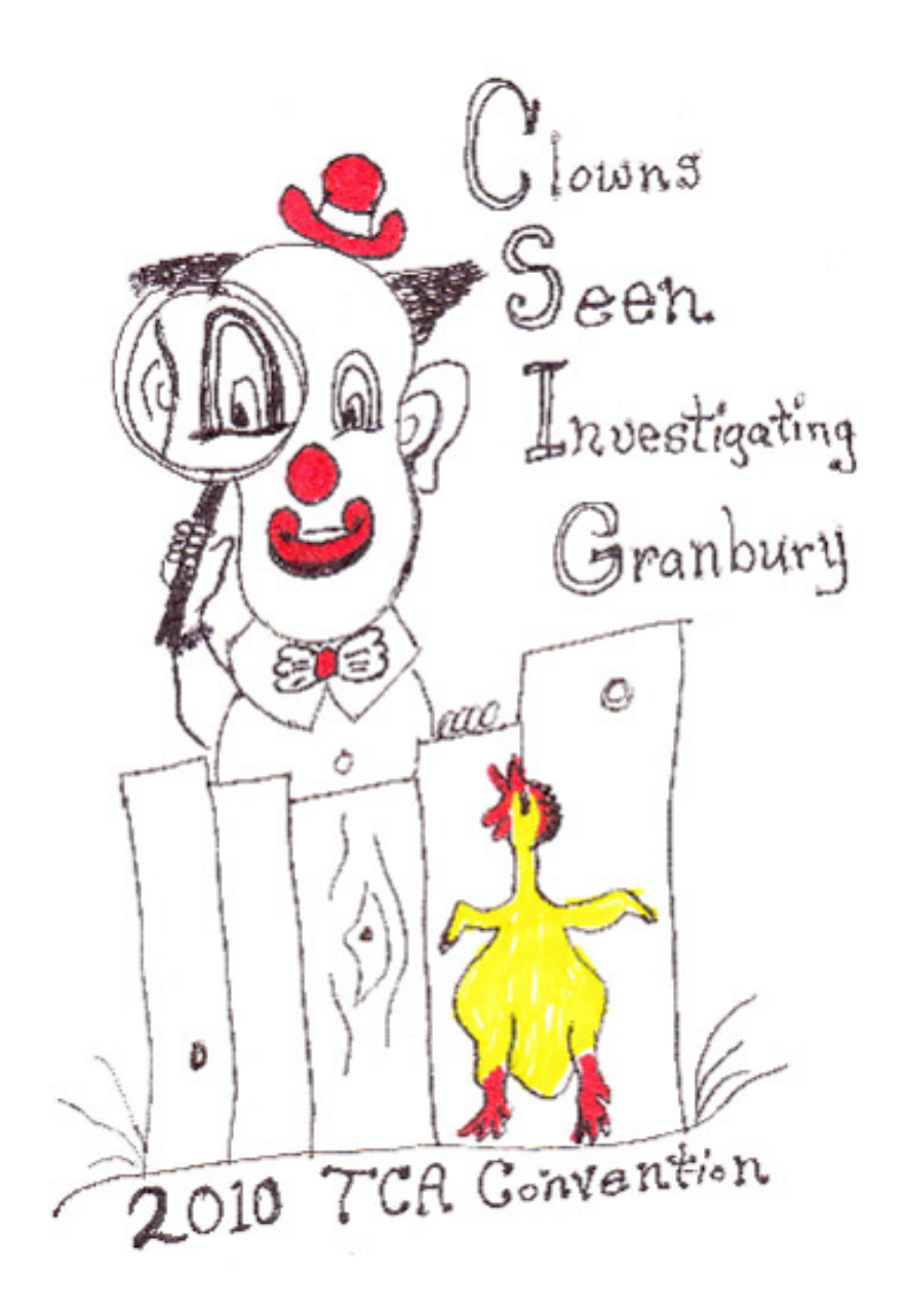
THE TEXAS CLOWN ASSOCIATION JULY-AUGUST