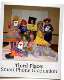
Third Place: Smart Phone Graduation