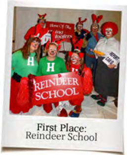
First Place: Reindeer School