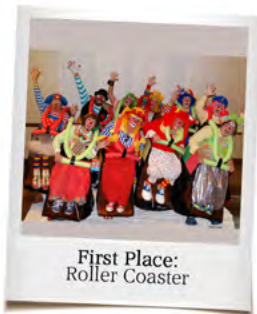
First Place: Roller Coaster