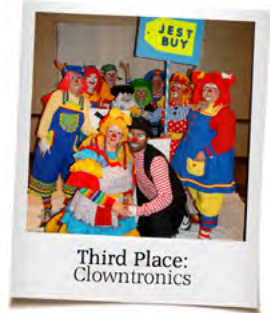
Third Place: Clowntronics