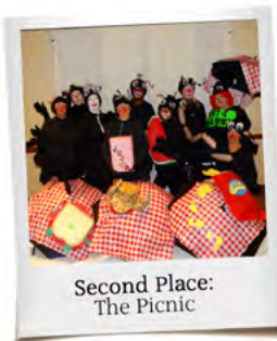
Second Place: The Picnic