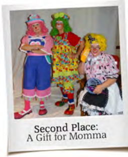
Second Place: A Gift for Momma