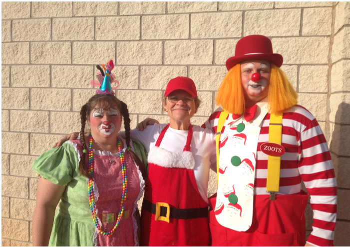
The Clown Arouns of Wichita Falls enjoyed twisting balloons for children attending the Christmas in the Park event in December. And sparked a new joey in the process.