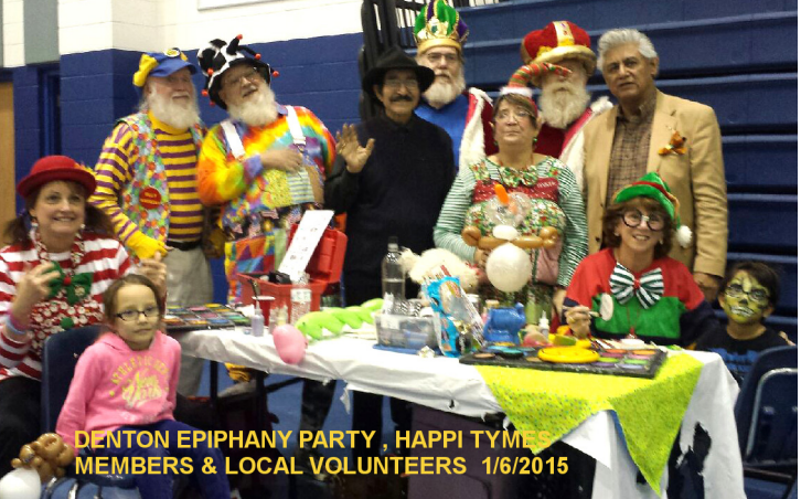
DENTON EPIPHANY PARTY , HAPPY TYME MEMBERS & LOCAL VOLUNTEERS 1/6/2015