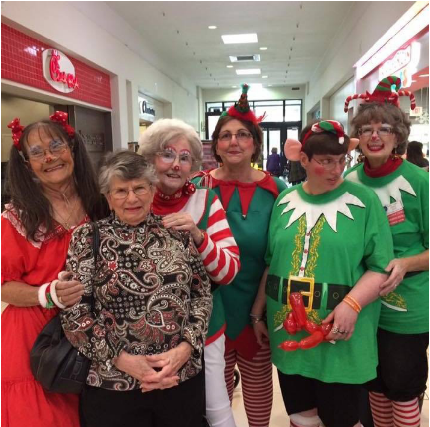
Rosy Nose Clown Alley helping with the Angel Tree program in Tyler. (page 10)