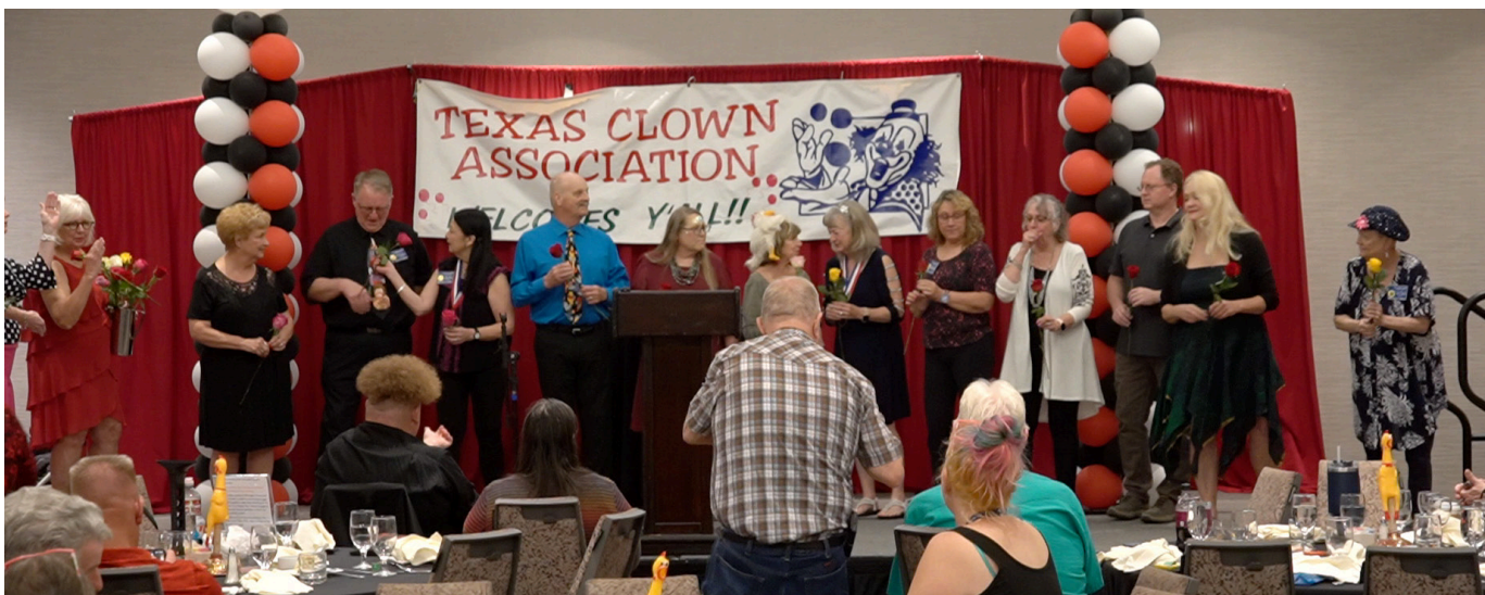
(Past ambassadors present at the 2023 TCA Convention)