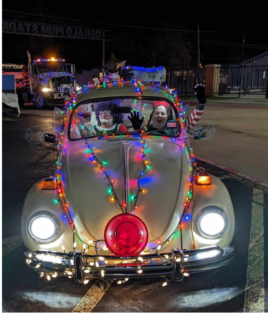
Memory Makers Christmas Parade